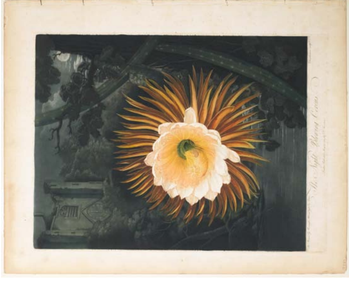
"The Night-Blowing Cereus" (1800)

Bloom responds to Southampton's history with specific links to Gods House Tower.